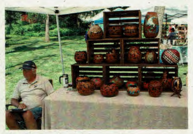
Fine Craft Display