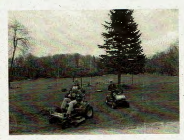
The Lawn Crew

As custodians, we feel we have a duty to leave the Historical Park better than we find it. I believe we are doing just that.