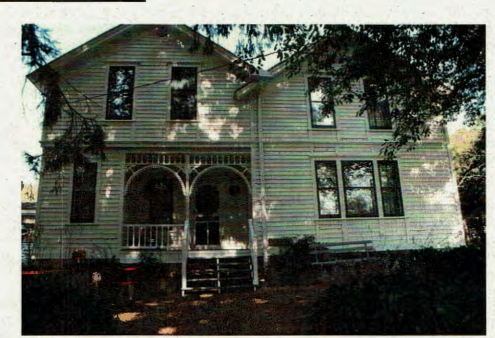
The Mill House