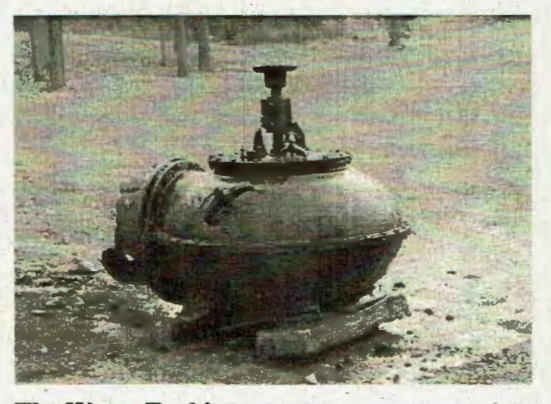
The Water Turbine

Our next major project will be the reconstruction of the Engine Shed on the south side of the Mill. This will begin in 2019. It will house our restored Superior Engine which we have had outside near the Mill for several years.