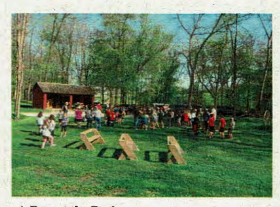
A Day at the Park