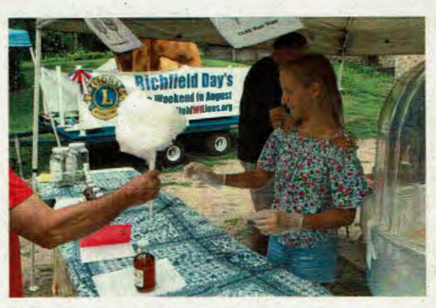
Maple Cotton Candy Treat