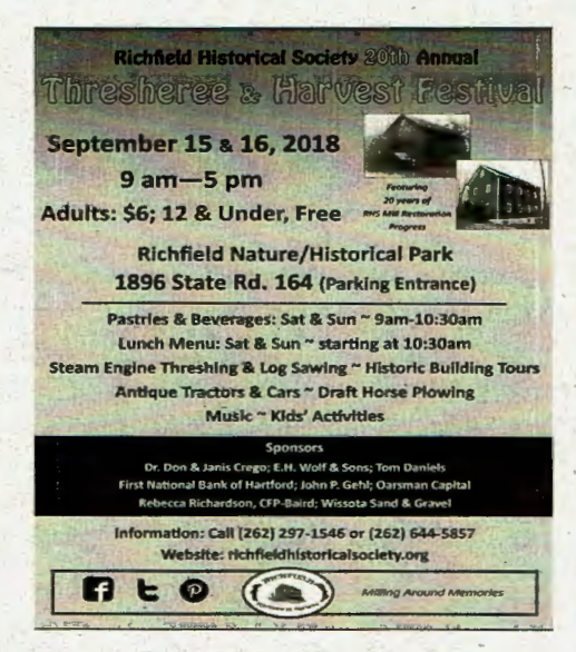
Thresheree & Harvest Festival – Saturday & Sunday, September 15 & 16, 2018