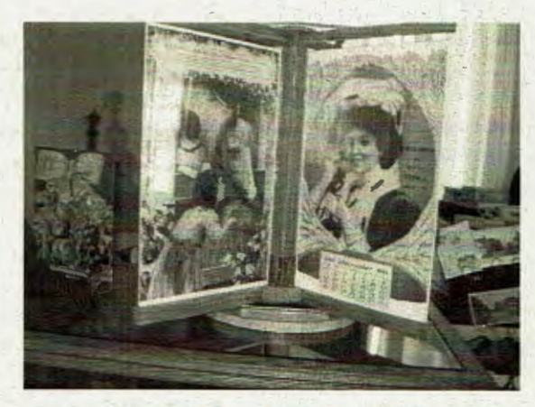
Early 1900s Calendar Display at LWC

In addition to the map project, Norb designed and built a rotating display which features early 1900s calendars. A lot of hard work and time went into both of these projects.