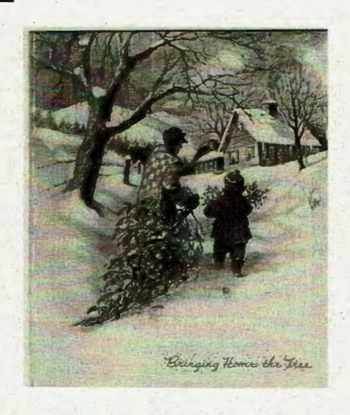
Christmas in Richfield -Saturday, December 1, 2018